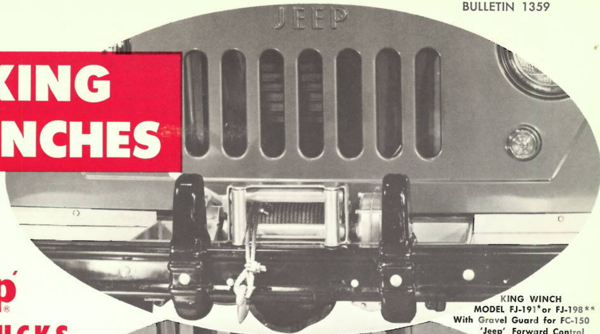
KING WINCH MODEL FJ-191* or FJ-198** With Gravel Guard for FC-150 'Jeep' Forward Control